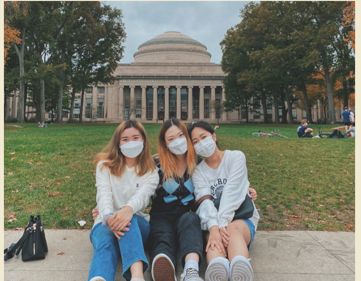
▲ At Great Dome located in MIT, Cambridge