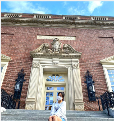
▲ In Harvard Art Museums