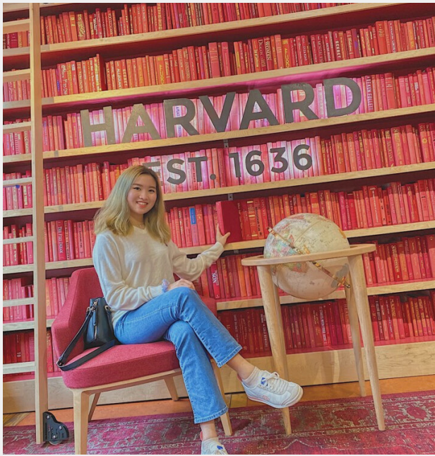
▲ Harvard University, Cambridge