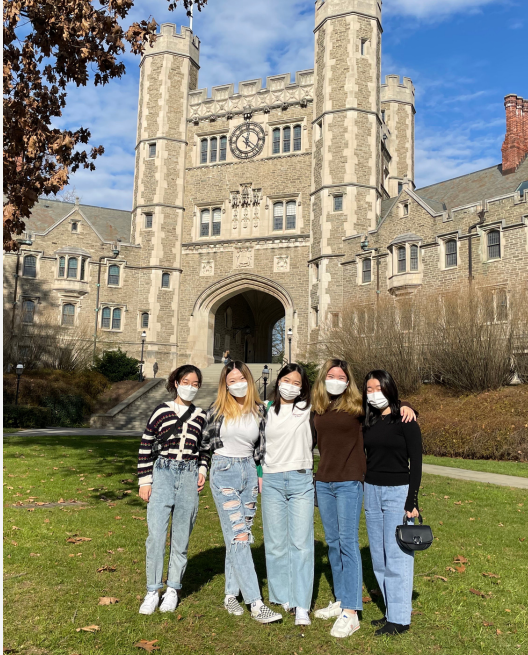
▲ At Blair Hall

The dorm students went to Princeton, NJ for the November college tour.