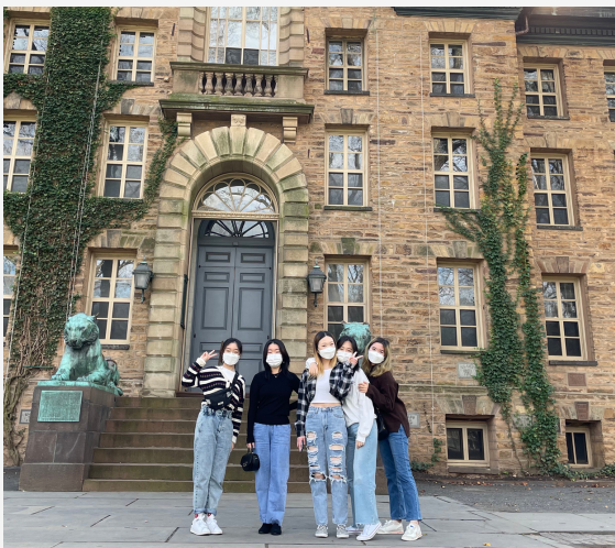
▲ At Nassau Hall

Princeton University is one of the IVY league universities and is the fourth-oldest institution of higher education in the United States. The school is known for its top-quality teaching and tight-knit student community. Students in the classes are motivated and the professors are all experts in their respective fields. It is also known for social sciences, engineering, biological and biomedical sciences.