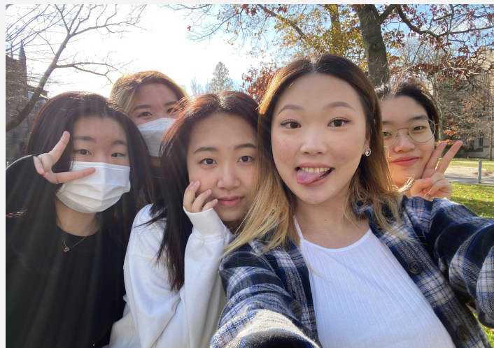
▲ Students taking a picture together

The students started the tour at Nassau Hall, the oldest building at Princeton University. Since it was during Thanksgiving break, there were few students on the campus so the students had a good chance to walk around and get to know the school. All the buildings are old but still look beautiful. The dorm students had such a good time there, hanging out and taking some pictures together.