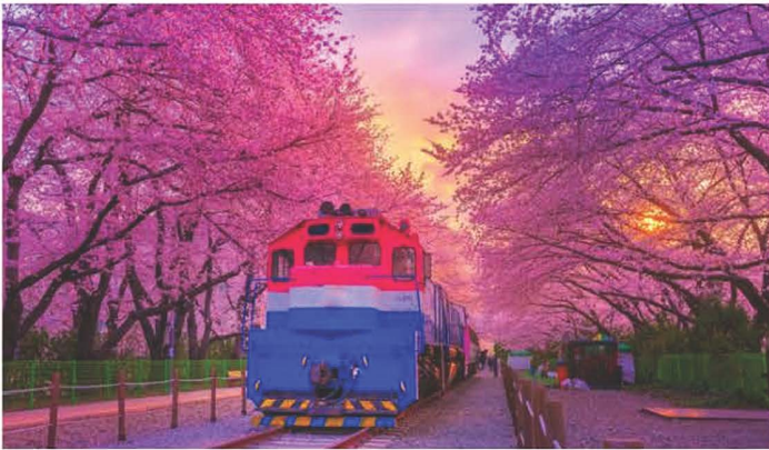
Breathtaking Cherry Blossom Festivals in Korea

Springtime is a time of warmer weather and renewal! Its arrival is celebrated in different ways around the world!