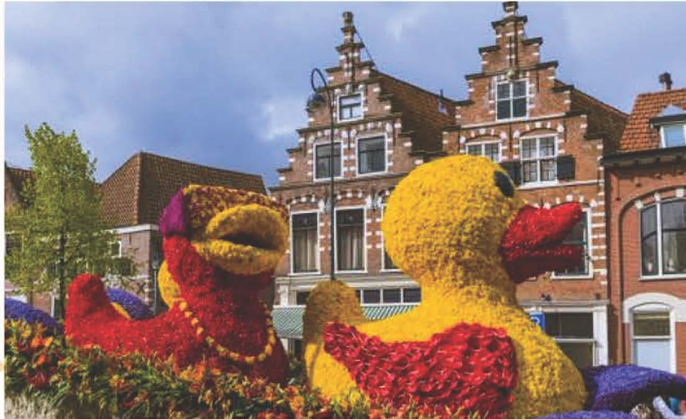
Flower Parades in Bollenstreek Holland

How will you and your family celebrate spring? Ask your international student about their cultural spring celebrations!