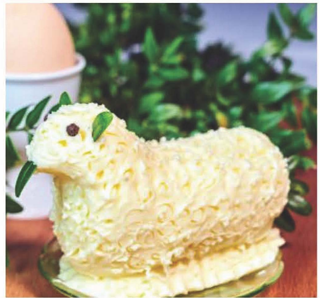
Butter Lambs adorn tables in Central and Eastern Europe

How will you and your family celebrate spring? Ask your international student about their cultural spring celebrations!