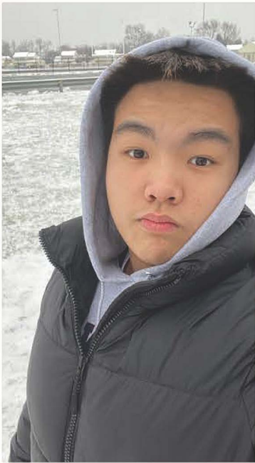
Bundle up! Fun in the snow!